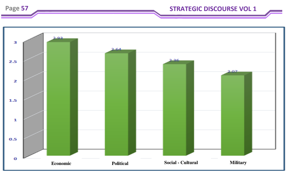
Chart II: Ranking of the opportunities of the components