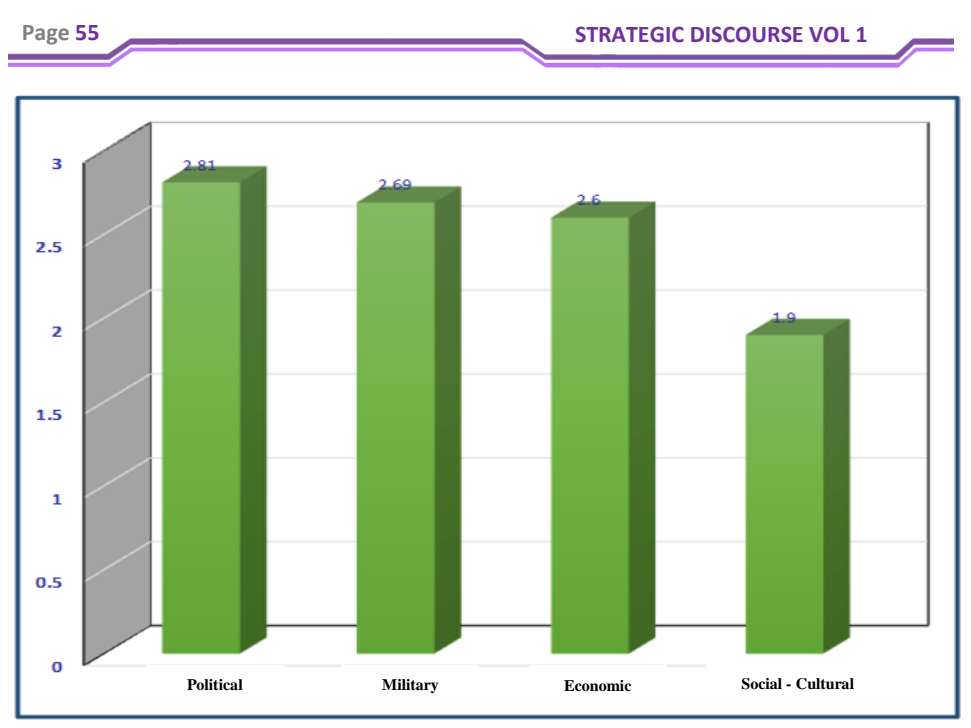
Chart I: Ranking of the consequences of the components